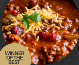
WINNER OF THE BEST CHILI

To everyone who made our Chili Cook-Off a success! A big shout out to all of the entries!