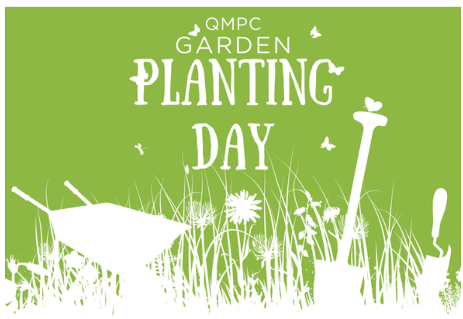
May 10 starting at 9am...we will work in the garden, spread mulch around the grounds and prepare our beautiful campus for the summer...there is lots of work to do, many hands make light work!

The Garden Team will start meeting in the garden from 8:30 to 9:30am every Tuesday and Friday morning for garden maintenance and care. This will consist of weeding and watering the plants, spraying the plants and harvesting the vegetables. Care of the Memorial Garden will be weeding the beds, pruning the plants when appropriate and planting annuals.